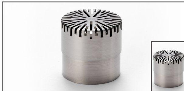
Fig. 1 1/2-inch Wide-frequency, Free-field Microphone Type 40AC (inset shows true size)

G.R.A.S. 1/2-inch preamplifiers (see data sheets for Types 26AG, 26AH, 26AJ, 26AK and 26AM) are also available for use with the Type 40AC. The mounting thread (11.7 mm - 60 UNS-2) is compatible with other available makes of similar microphone preamplifiers.