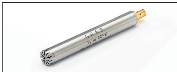
Fig. 1 Array Microphone Type 40PH with integrated CCP preamplifier

Close manufacturing tolerances together with the advantages of the TEDS chip, provide the Type 40PH with a high degree of interchangeability; a